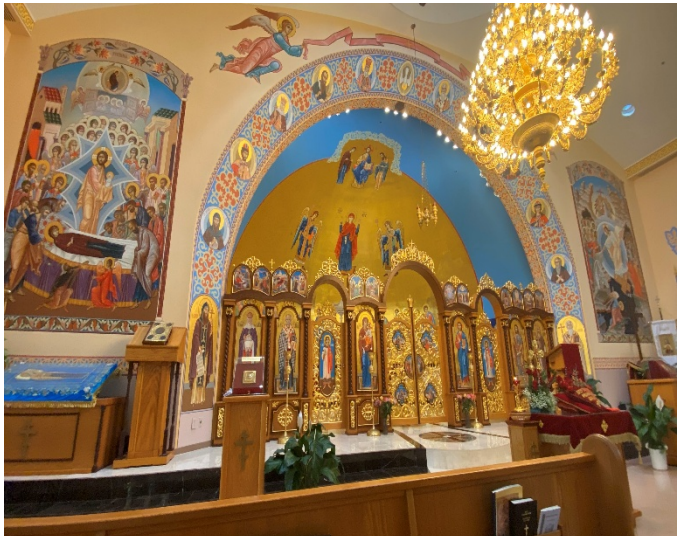
View of sanctuary with screen separating the sanctuary (sacred) from the profane (unsacred) Nave.