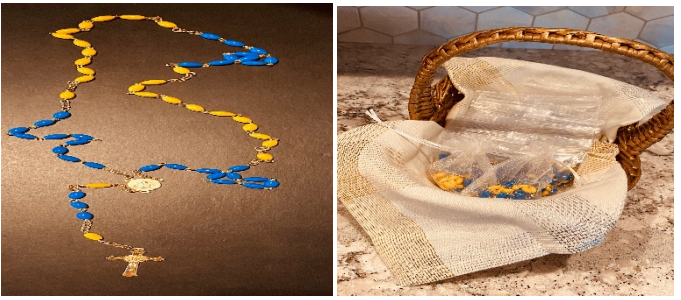
Blue and Yellow Rosaries